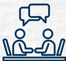
One-on-One Feedback by Experts