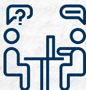
Mock interview & Feedback by an Expert Panel