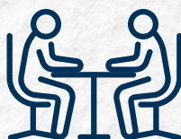
One-on-One Personal Sitting