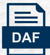
DAF-II Filling Session